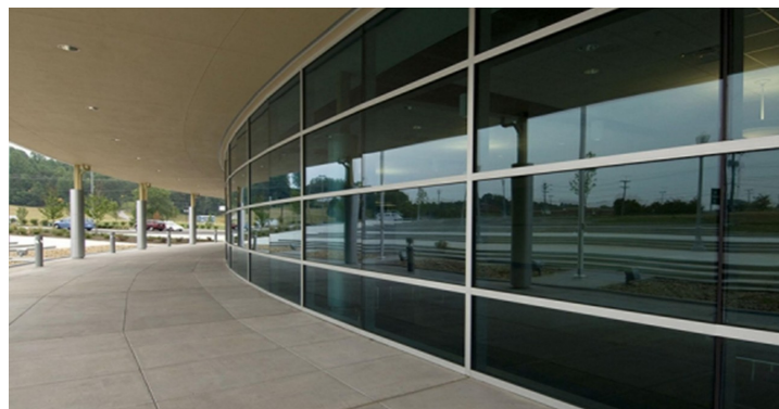
New Hope Visitor Center at Y-12

Additionally, meeting attendees should dress appropriately (not excessively informal) and should wear sturdy shoes. We are looking forward to seeing everyone there.